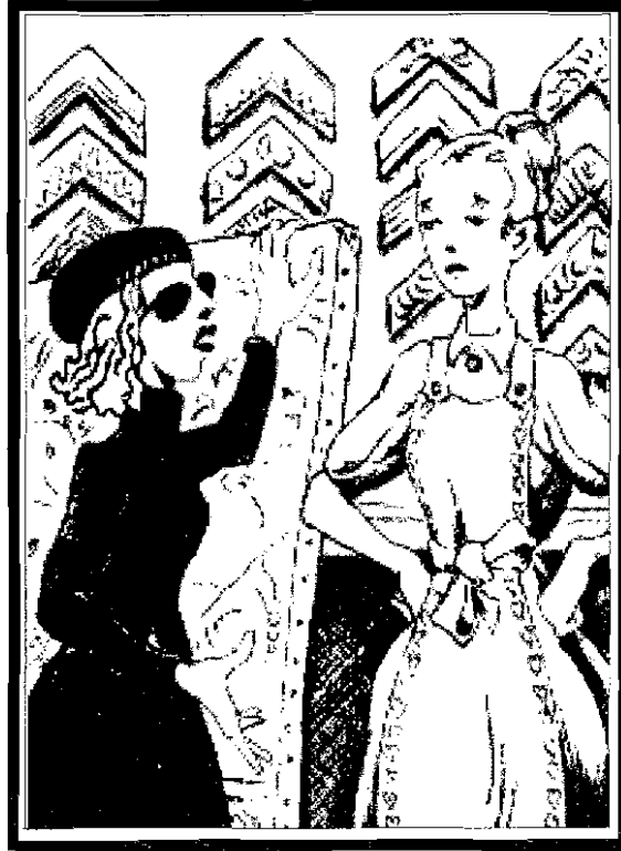
I was wanting to get this framed in a Louis the fourteenth with gold leaf for about $150.00.