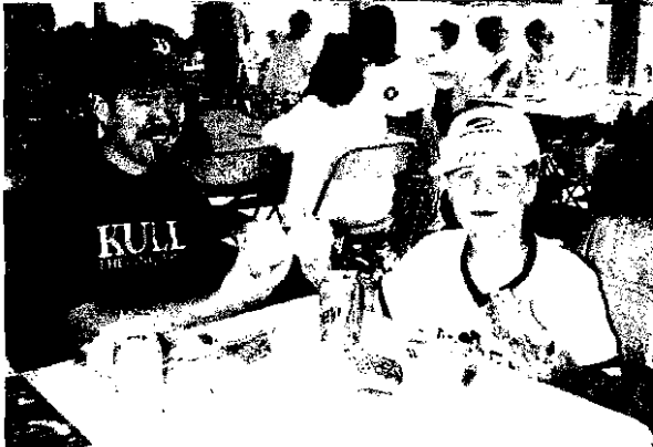
A gourmet picnic lunch and baseball makes a good time for all.