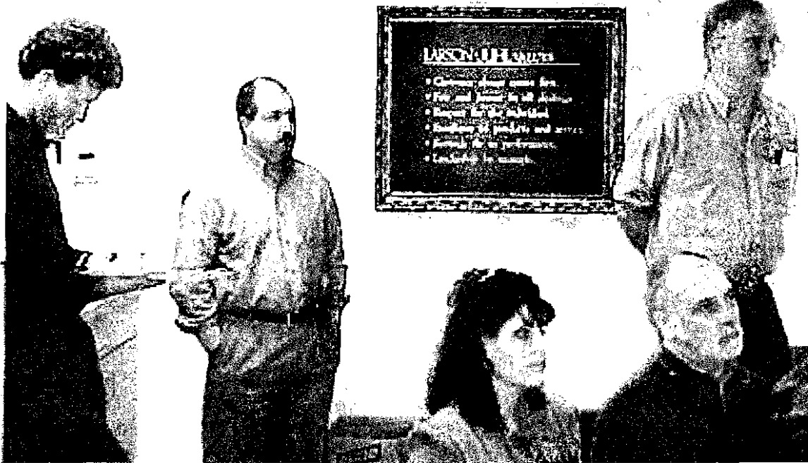
Some EPFG members and reps at Larson-Juhl during the January 2001 meeting.

You will be receiving you class registration packet mid January. Class size will be limited so watch you mailbox and sign up early to reserve you place.